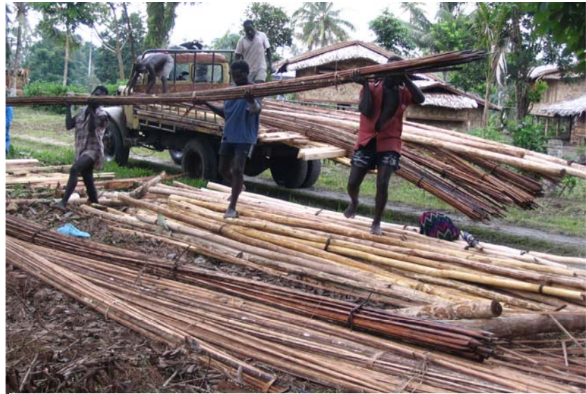
Above: Construction work progressing according to schedule

We hope you will enjoy reading to catch up with the times. Our journalists are bound by their professional code of ethics to report what they see happening with their physical eyes. They will