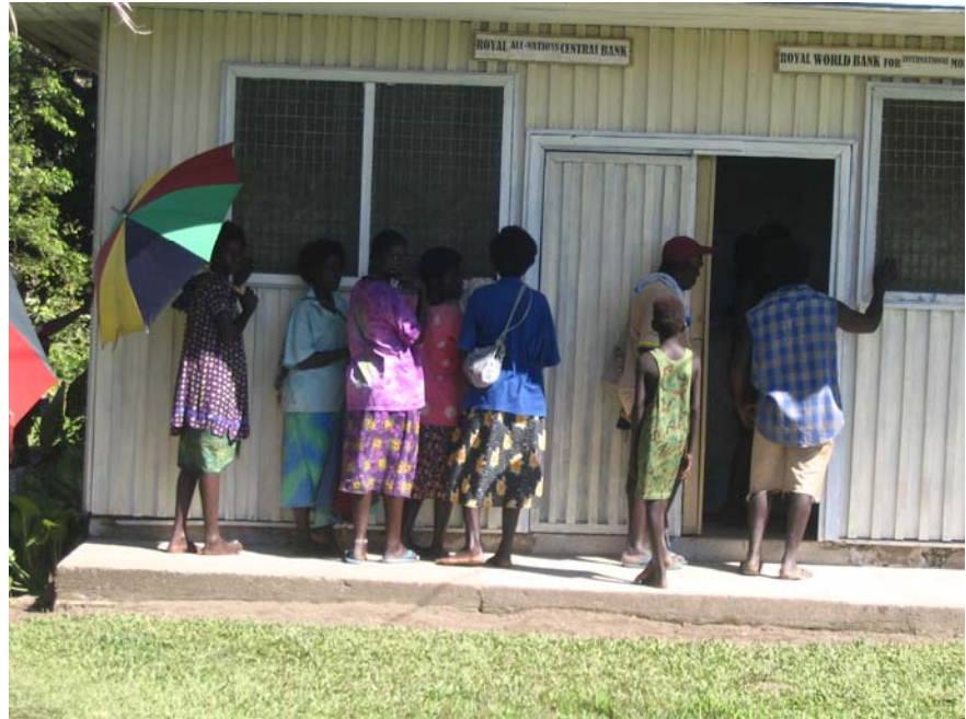
Above: Queing up for banking at R.I. Bank of Meekamui, Tonu

The King said of the bankers already working with the Royal International Bank of Meekamui, 4 of them left senior positions with commercial banks in Papua New Guinea after they were offered jobs with the RIBM.