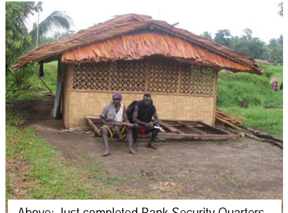
Above: Just completed Bank Security Quarters

Meanwhile work is progressing to schedule on new RIBM buildings overseas in the PNG provinces of West New Britain, Manus, East Sepik, Madang and Morobe.