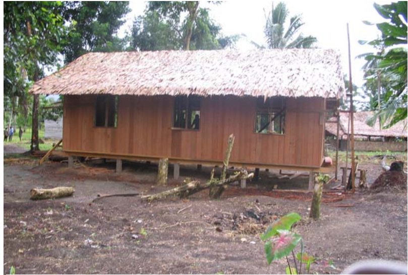
Above: Royal Post Office during construction

It is understood many tertiary institutions in PNG had registered Bougainville students to study at their campuses following guarantees from the Central Bank of Bougainville (Reserve Bank of Papala) that their school fees would be paid for.