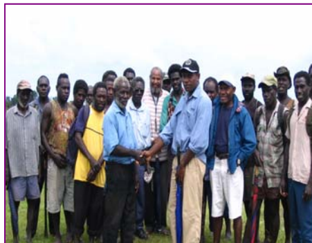
Officials Open Tonu airport, a funded development.

A fully pledged Meekamui Defense Force has been allocated K16 Billion to be followed closely by Foreign Affairs, Education, Health, Forest, Environment and Conservation, Housing, Public Service, Home Affairs and Land, Air and Sea Transport