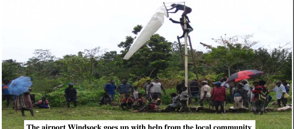
The airport Windsock goes up with help from the local community

Mr Riki recommended several more improvements needed including installation of the windsock or wind direction indicator, plastic cone markers, felling of trees on the northern approach and further compaction with gravel of northern landing and take-off area, which were carried out before the airport was opened by the Siwai District