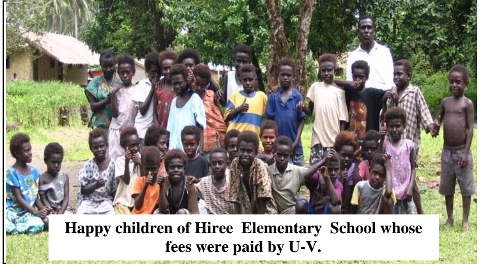
Happy children of Hiree Elementary School whose fees were paid by U-V.

"Who-ever comes next will be the next to get their money", said the King.